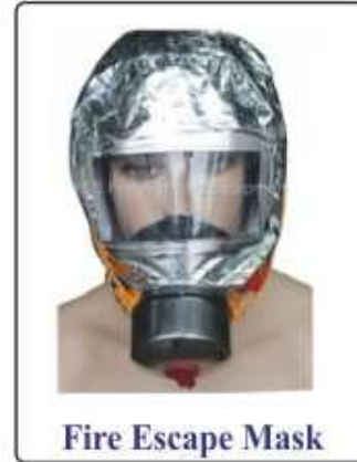
Fire Escape Mask