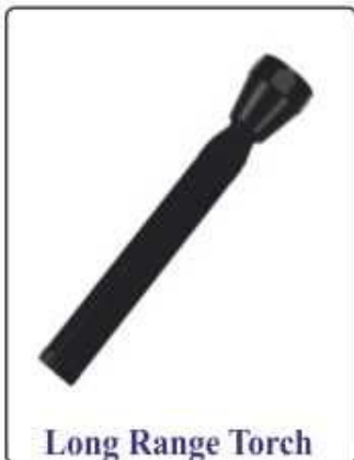
Long Range Torch