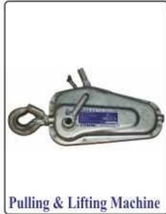
Pulling & Lifting Machine