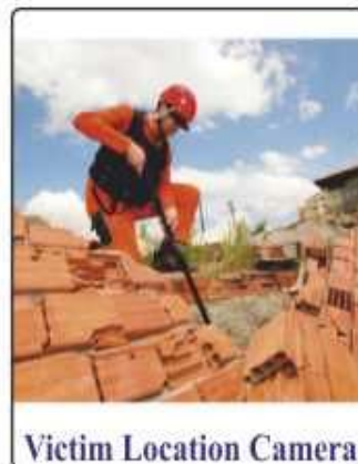
Victim Location Camera